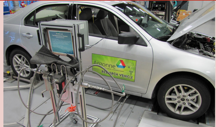
Figure 2. Ford Fusion Test Vehicle

Argonne National Laboratory used a 2011 Ford Fusion mid-sized sedan with a 2.5-L, 4-cylinder engine (175 HP) and 6-speed automatic transmission (Figure 2). Its EPA fuel-efficiency label shows 23 mpg city/33 mpg highway and 26 mpg combined. We equipped the vehicle to measure numerous engine parameters and temperatures, including catalyst inlet and brick temperatures and oil and coolant temperatures. We collected data in one of Argonne's test cells at the Advanced Powertrain Research Facility (APRF), using a SemtechD emissions analyzer for emissions and a direct fuel flow meter for fuel measurement. The vehicle was prepared and run by using approximate Federal Test Procedure (FTP) standard ambient temperature testing criteria. The emissions of interest in this study include total hydrocarbons (THC), nitrogen oxides ( \text{NO}_x ), carbon monoxide (CO), and carbon dioxide ( \text{CO}_2 ) (Tables 1 and 2).