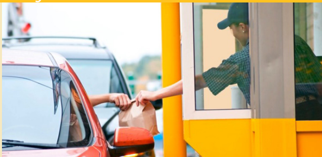
Figure 1. Americans love their drive-throughs, but are they more fuel-efficient and environmentally friendly than parking and going into the restaurant?

The bulk of idling research to date has focused on the effects of heavy- and medium-duty diesel vehicle idling. Most research has ignored passenger car idling—even at schools—as a source of emissions and wasted fuel. While idling in traffic is necessary for safety, vehicles can be turned off while waiting for passengers or for freight trains to pass. Consumers can choose to park and enter a fast-food restaurant, rather than idle in a drive-through line (Figure 1). If each car in the United States idles just 6 minutes per day, about 3 billion gallons of fuel are wasted annually, costing drivers $10 billion or more. And they haven't gotten anywhere!