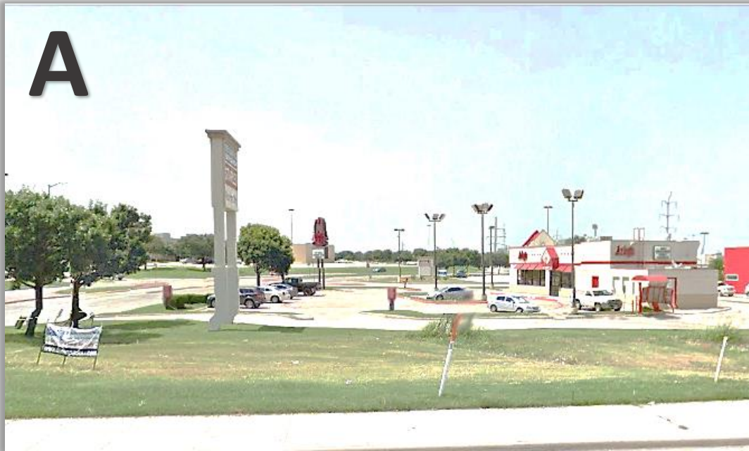
Commercial Street View