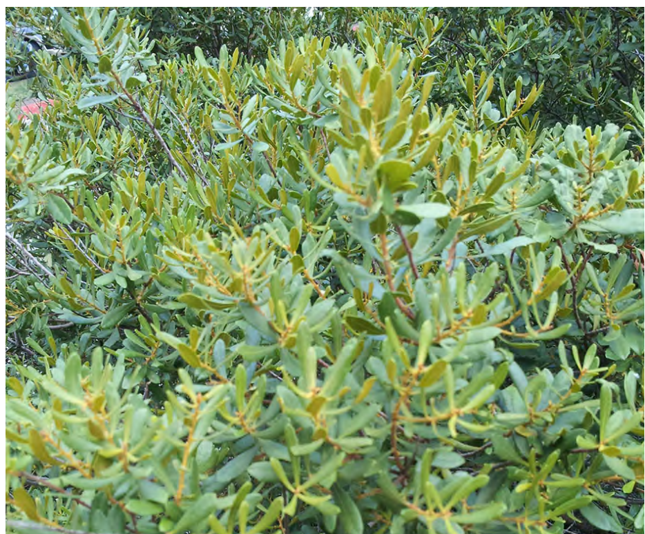
Dwarf Wax Myrtle