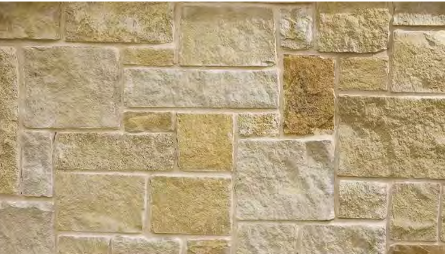
Lueders Limestone Veneer