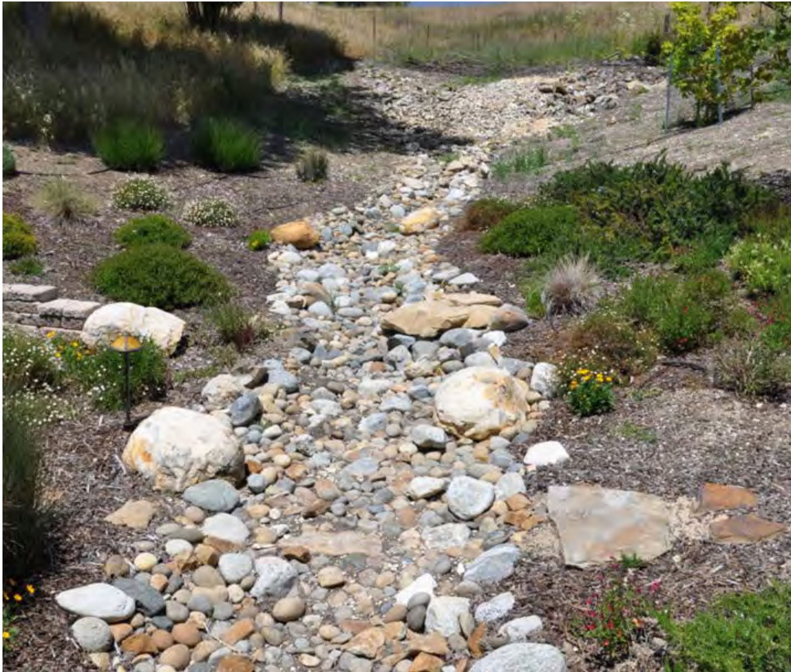
Dry River Bed