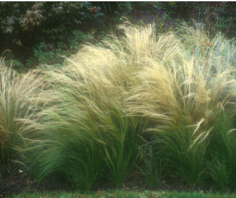
Mexican Feather Grass