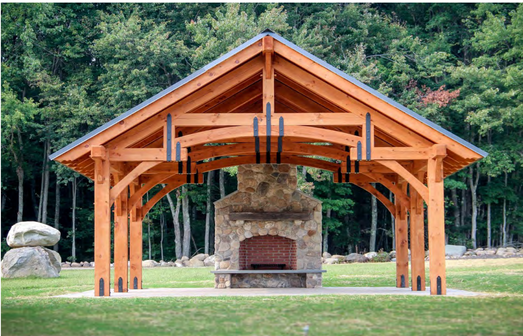
Timber Frame Structure

ATTACHMENT J TO EXHIBIT B Hardscape Materials Palette