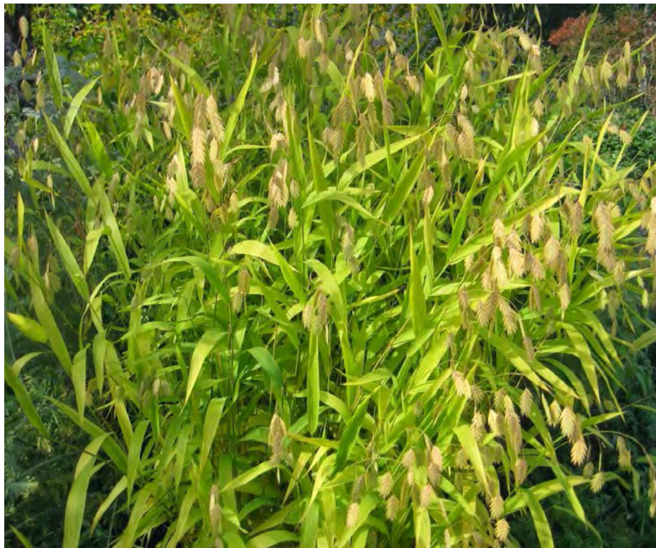
Inland Sea Oats