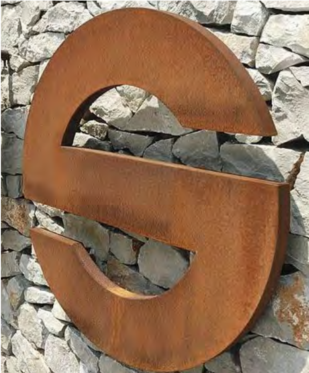
Corten Steel Sign Letters