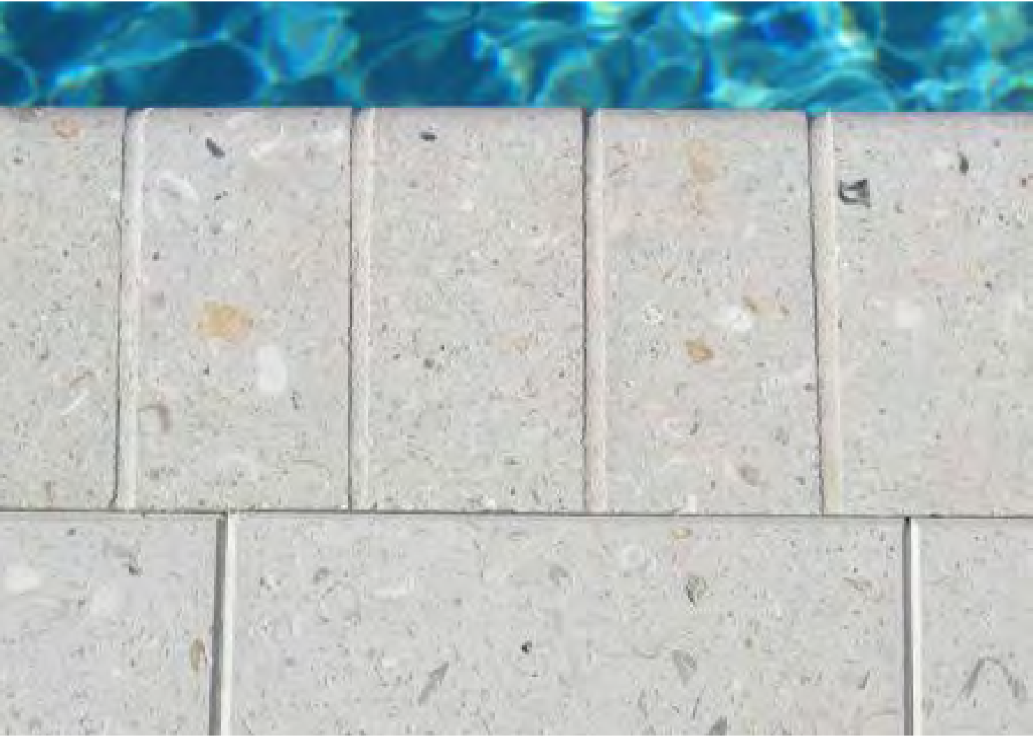
Shellock Pool Coping