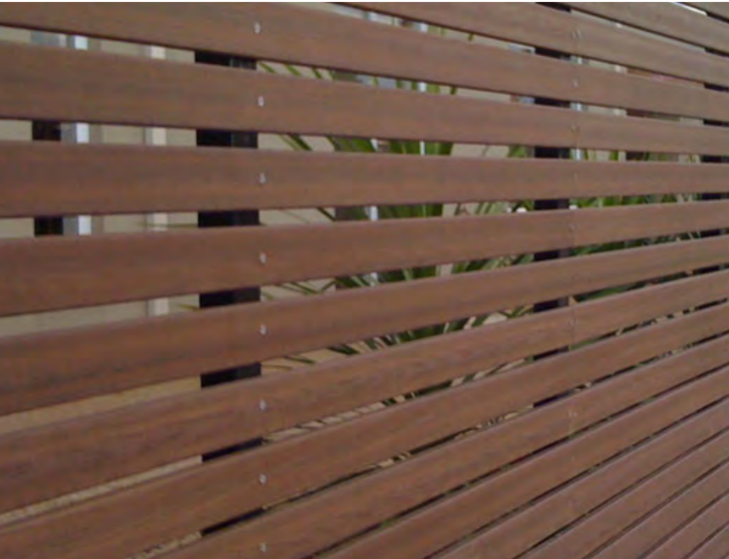
Stained Wood Screen Wall