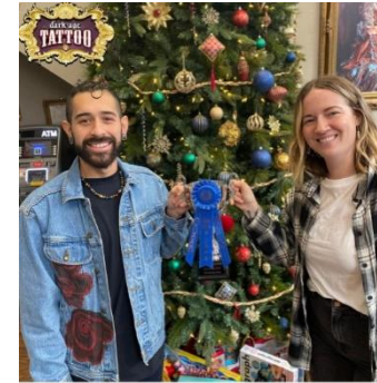
1ST PLACE DARK AGES