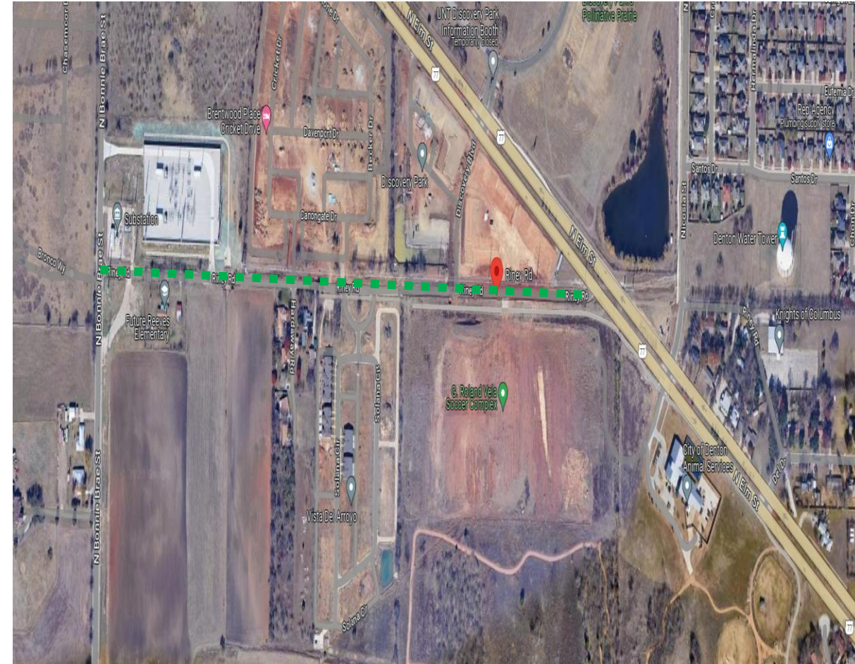
..... Proposed Project

Project Status: Initiation Schedule: Summer 2025 (Design) Spring 2026 (Implementation) Estimate at Completion: $ 6.5 Million TRiP Funding Request: $ 1.0 Million