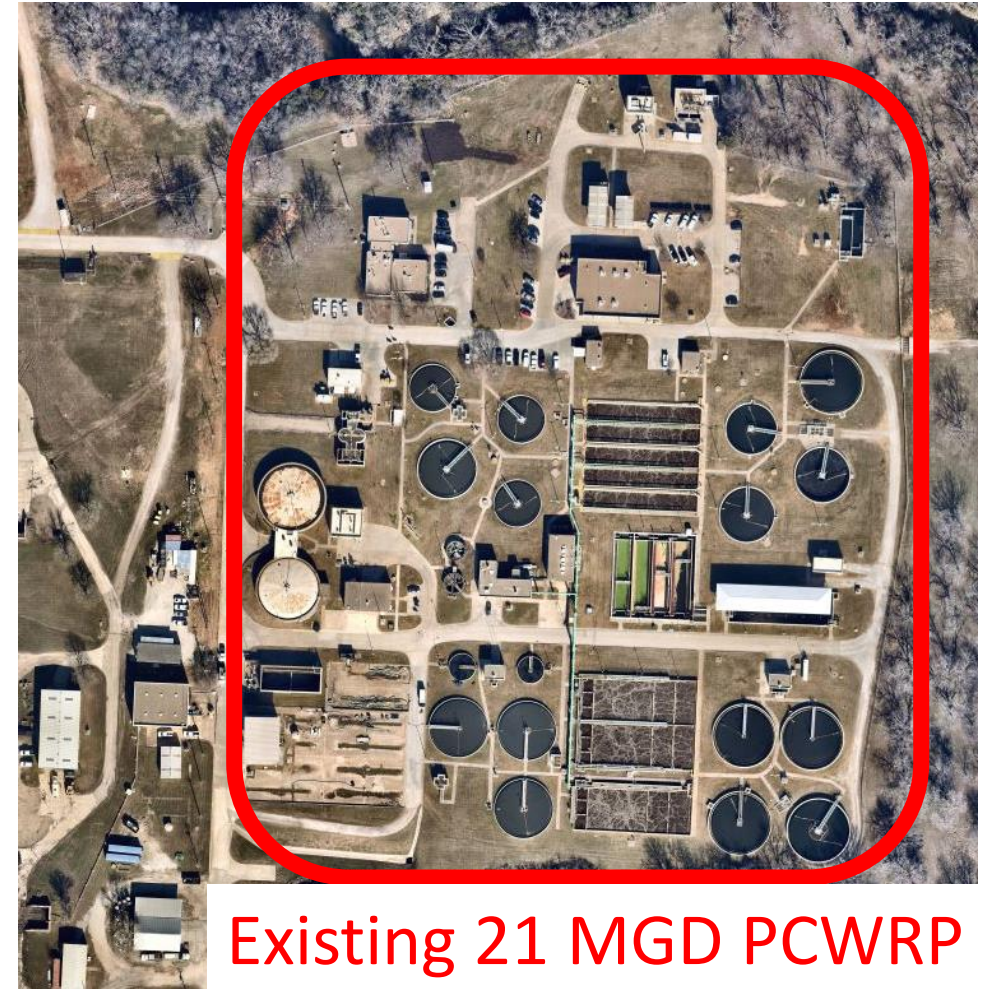
Existing 21 MGD PCWRP