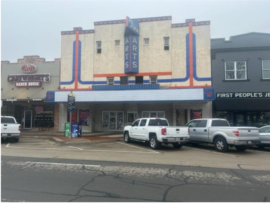
Exterior View: Front