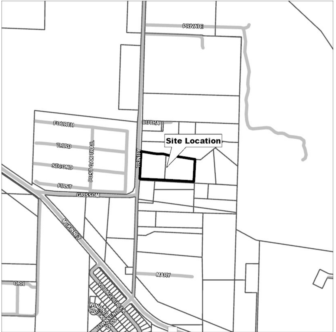
EXHIBIT B LOCATION MAP