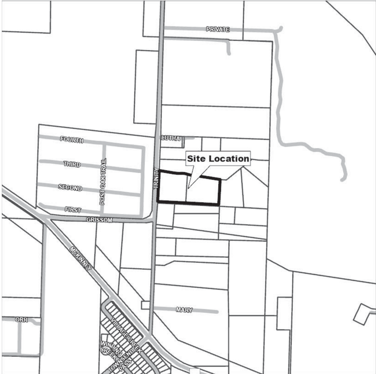
Exhibit B Location Map