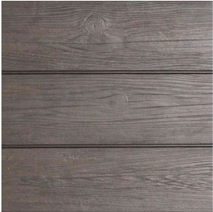
WS-1 FAUX WOOD SIDING - NICHHA VINTAGEWOOD “BARK”