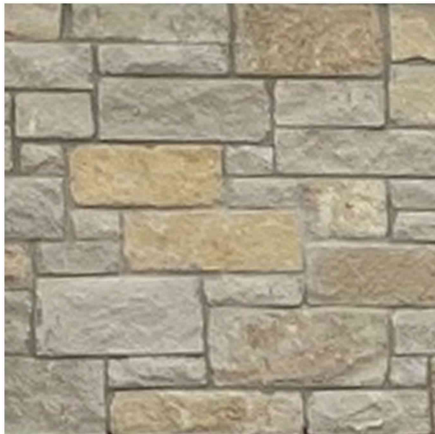
MV-1 MEZGER STONE - HODGES 50/50 BLEND FROM MEZGER ENTERPRISES (COURSED PATTERN)