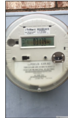
AUDIT OF METER READING & BILLING