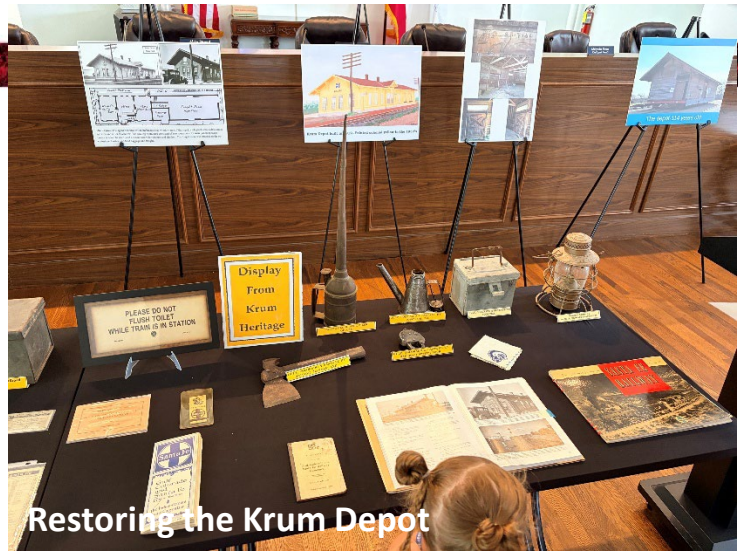
Restoring the Krum Depot