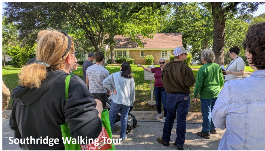
Southridge Walking Tour