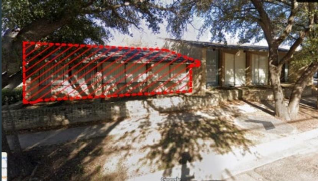
Existing to be demolished-Southwest View