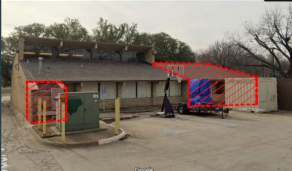
Existing to be demolished-Northeast View